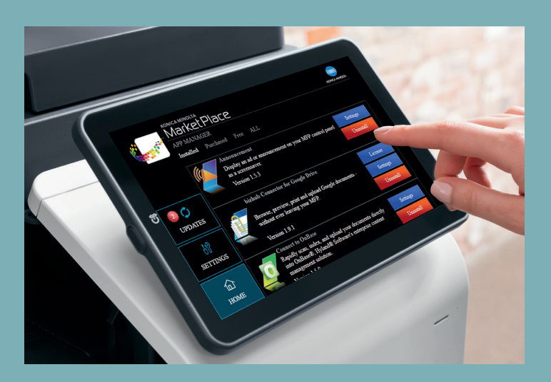
For more details on Konica Minolta MarketPlace, visit konicaminoltamarketplace.com

The i-Series provide a broad range of capabilities that serve all your needs. To minimize the time spent using your device, simply change the control panel to meet your preferences. And because the user operation of any model is completely customizable, there's no need for specific training.