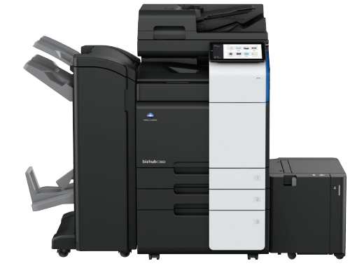
bizhub i-Series C360i