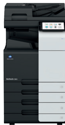
bizhub i-Series C360i