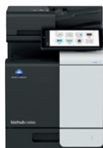
bizhub i-Series C4050i

So as your business grows, we will grow with you – seamlessly linking people and places to give a new dimension to document workflow and security management.